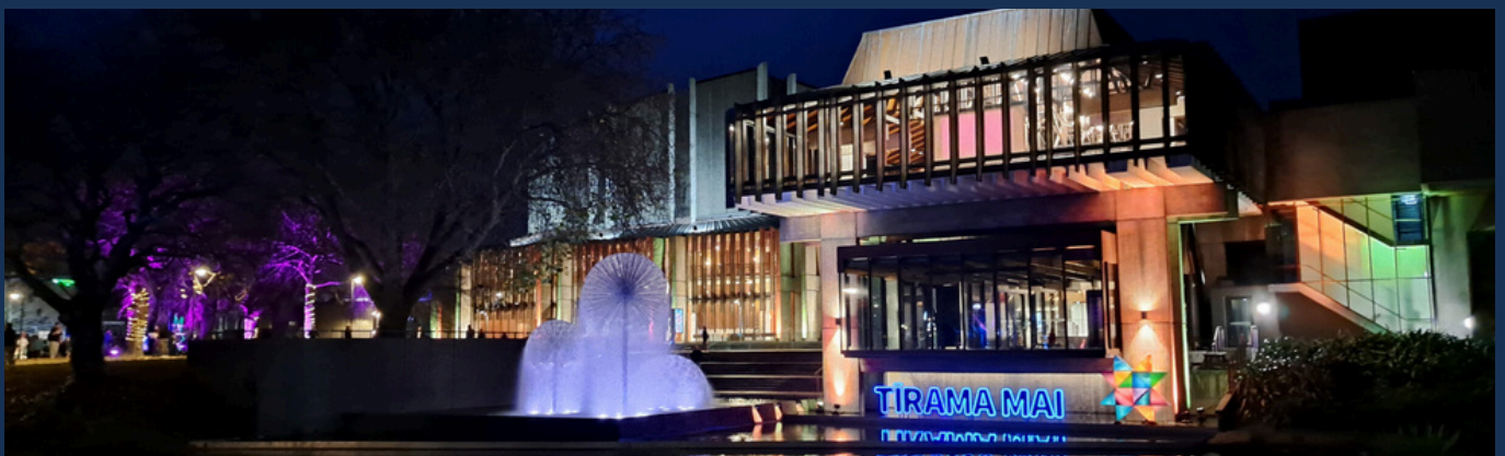
13 minutes to the city centre