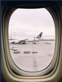
11 min to the airport