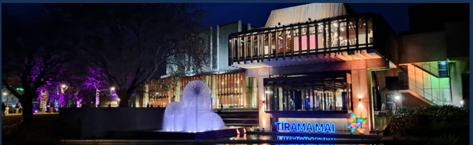
13 minutes to the city centre