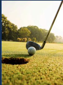
15 min to golf course