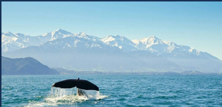
140 minutes to Whale Watch