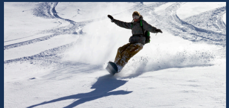
80 minutes to the ski slopes