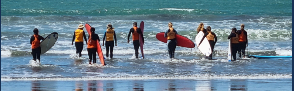
27 minutes to the beach