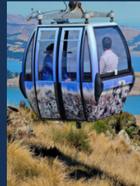
35 min to gondola