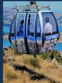
35 min to gondola