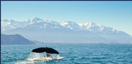
140 minutes to Whale Watch