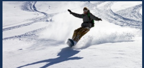
80 minutes to the ski slopes