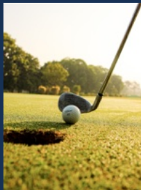
15 min to golf course