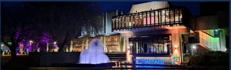
13 minutes to the city centre