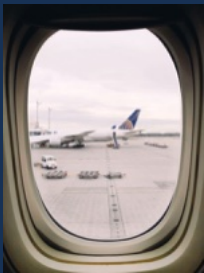
11 min to the airport